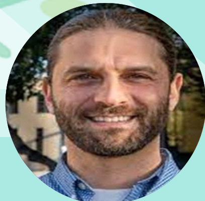
Kevin Weinberg, USA Solar Industry Expert-Overseas