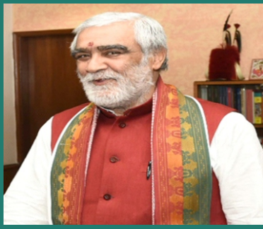
Hon. Ashwini Kumar Choubey

Union Minister of India for Environment, Forest & Climate Change