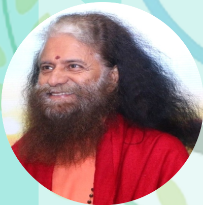
Pujya Swami Chidanand Saraswati President of Parmarth Niketan, Founder of Ganga Action Parivar