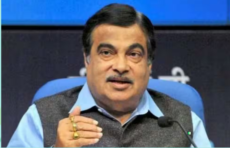
Shri Nitin J Gadkari Minister of Road Transport & Highways, Govt. of India