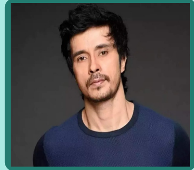
Actor Darshan Kumar

Union Minister of India for Environment, Forest & Climate Change