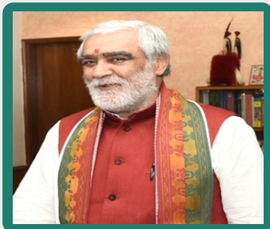
Hon. Ashwini Kumar Choubey

Union Minister of India for Environment, Forest & Climate Change