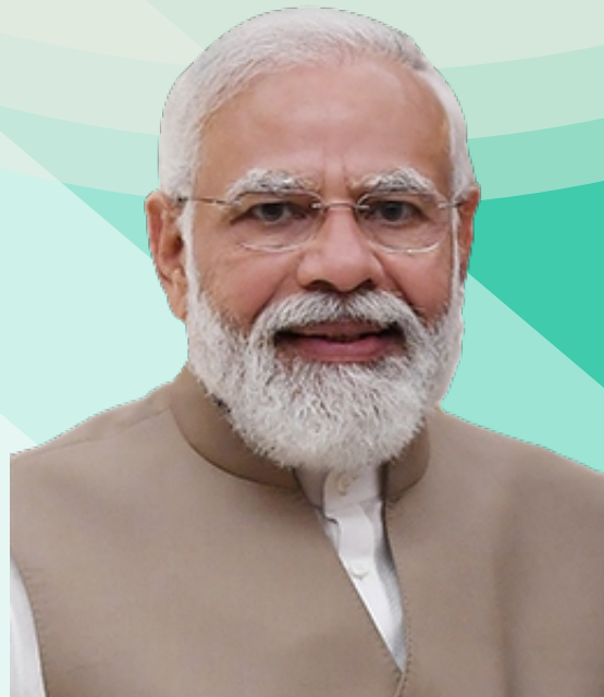
NARENDRA MODI (PRIME MINISTER OF INDIA)

5th JUNE 2023, SEMINAR HALL, IIT-Delhi HAUZ KHAS-110016